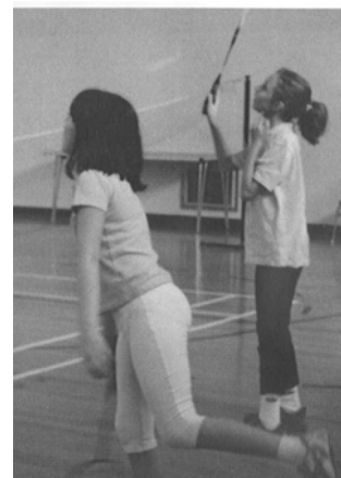
Badminton Club meets every Thursday